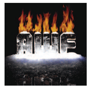
Sullair AWF Compressor Fluid Improved hot and cold weather lubrication. Longer compressor fluid life. Extended airend warranty.