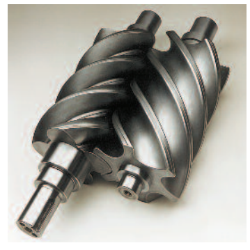
Rotary Screw Compressor by Sullair The pioneer in Rotary Screw Technology.

The user friendly Control Panel (housed in a weathertight enclosure) provides real time system information.