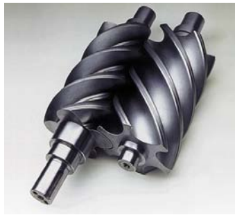
Rotary Screw Compressor by Sullair The pioneer in Rotary Screw Technology.