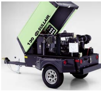
Clam Shell Canopy Compact/Lightweight Design.