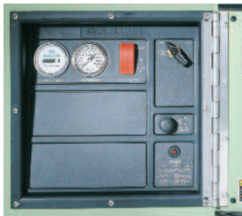
Curbside Instrument Panel With (SSAM) Shutdown System & Annunciation Module.