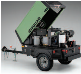
Clam Shell Canopy Compact/Lightweight Design.