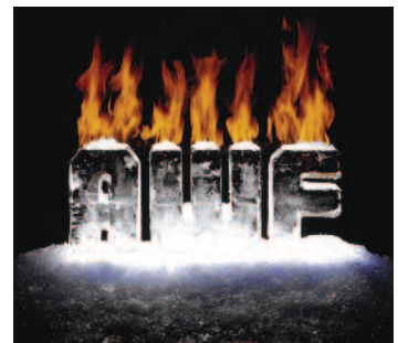
Sullair AWF Compressor Fluid Improved hot and cold weather lubrication. Longer compressor fluid life. Extended air-end warranty.