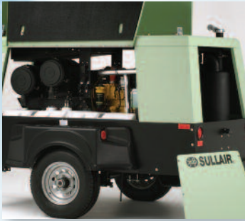
Total Accessibility Routine maintenance is simplified.