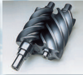
Rotary Screw Compressor by Sullair The pioneer in rotary screw technology.