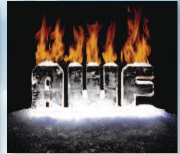
Sullair AWF Compressor Fluid Improved hot and cold weather lubrication. Longer compressor fluid life. Extended air end warranty.