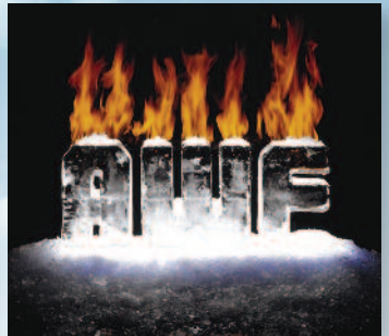
Sullair AWF Compressor Fluid Improved hot and cold weather lubrication. Longer compressor fluid life. Extended air end warranty.