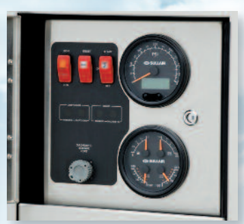
Monitoring and Control System

The brains of the system monitors every aspect of the compressor and engine.