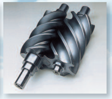
Rotary Screw Compressor by Sullair The pioneer in rotary screw technology.

The user friendly control panel (housed in a weather tight enclosure) provides real time system information.